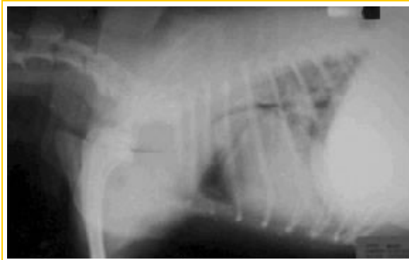
Same patient as above, a year later; trachea collapse has progressed from moderate to severe