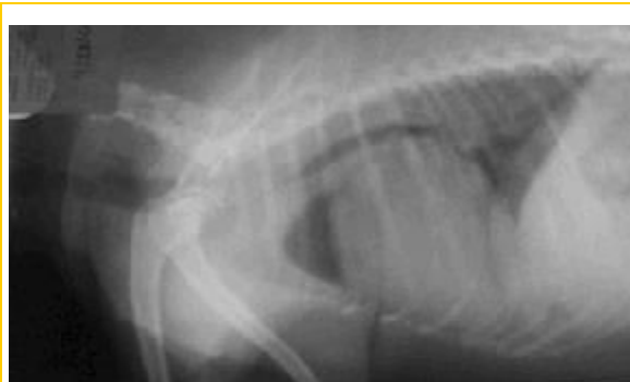
same patient exhaling (note the trachea collapse is much more pronounced)

Panting or rapid breathing for any reason makes the collapse and anxiety worse, which unfortunately tends to generate more rapid breathing and a vicious cycle of distress.